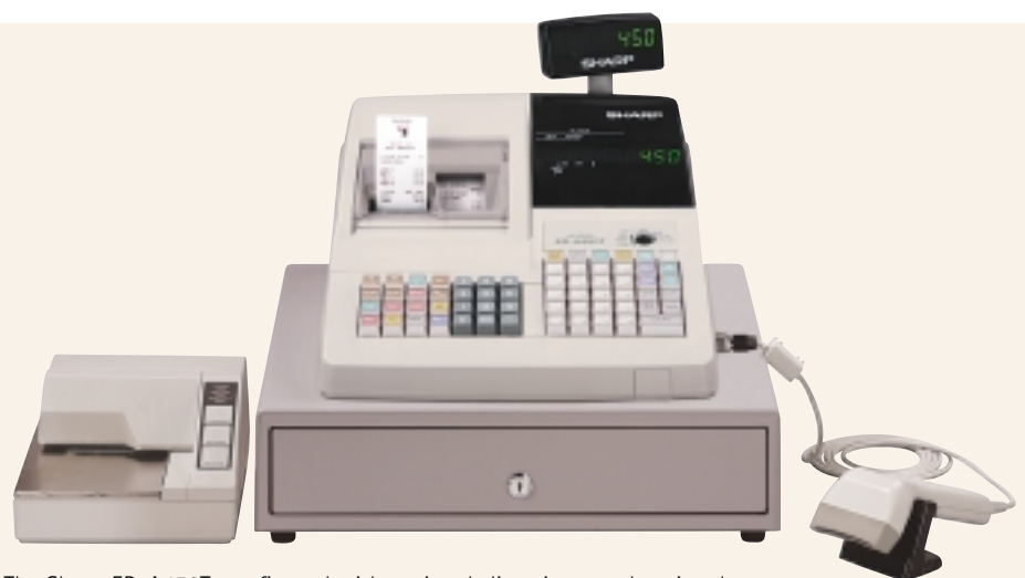
The Sharp ER-A450T, configured with optional slip printer and optional scanner, delivers superior functionality to your business.