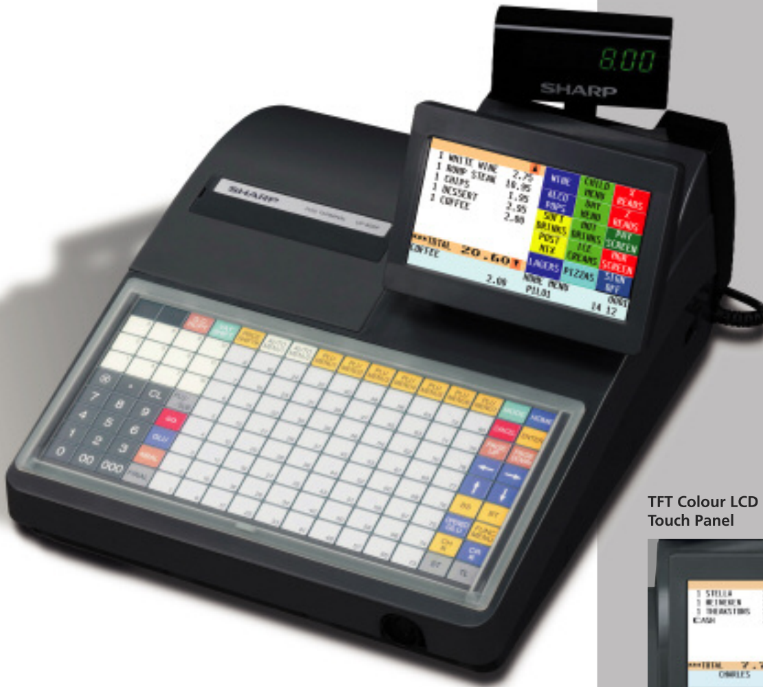
TFT Colour LCD Display with Touch Panel